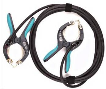
Current connection cable with TTA clamps