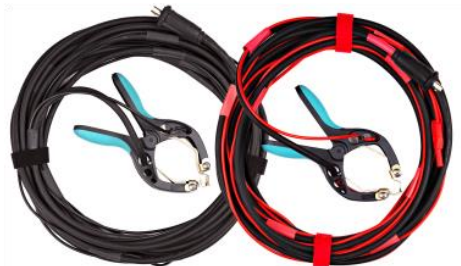
Current and Sense cables with TTA clamps

All specifications herein are valid at ambient temperature of + 25 °C and standard accessories. Specifications are subject to change without notice. Specifications are valid if the instrument is used with the standard set of accessories.