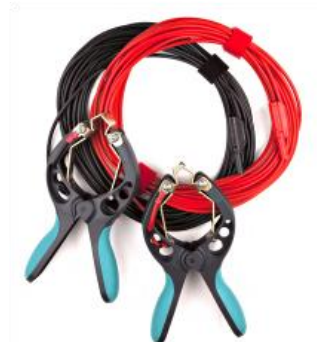
Voltage Sense cables with TTA clamps