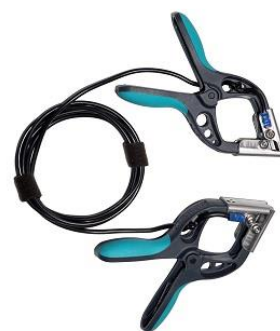
Jumper cable with small TTA clamps