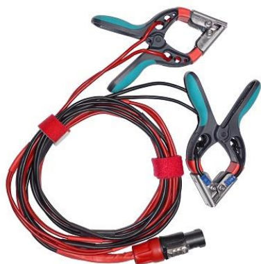
H winding current and sense cables with small TTA clamps

All specifications herein are valid at ambient temperature of +25 °C / +77 °F and standard accessories. Specifications are subject to change without notice.