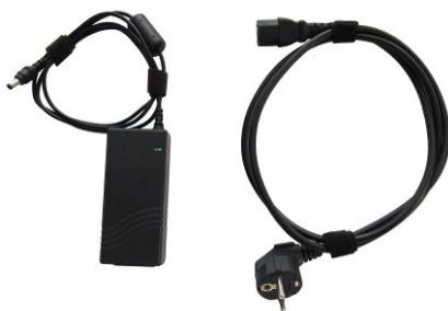
Power supply adapter