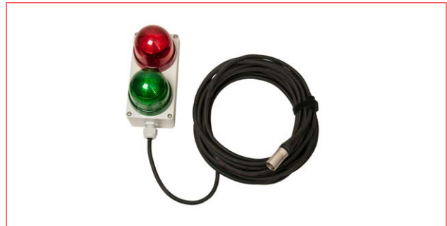
Indicator box (Safety beacon)